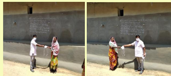
Distribution of Mask

Badlao Started an initiative called #pahel it's an effort on humanitarian ground to reach out to people who are starving hard for their daily bread in this pandemic situation. Protection kit which includes Khadi mask, homemade sanitizer, and soap.. Till now Badlao provided khadi mask and soap to 165 villagers in kewarjali and khadi mask to 40 villagers in Chandradeepa. Khadi mask and soap distributed in 30 villagers under Umang Project at Jamtara and Nala block. 200 khadi masks were given to DC office. Under project Umang funded by ICRW 2387 khadi mask and 1719 soap was distributed to adolescent girls of Jamtara and Nala block.