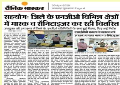
Newspaper Coverage of work related to networking