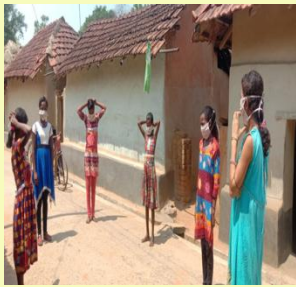
Mask distribution among adolescent under ICRW project