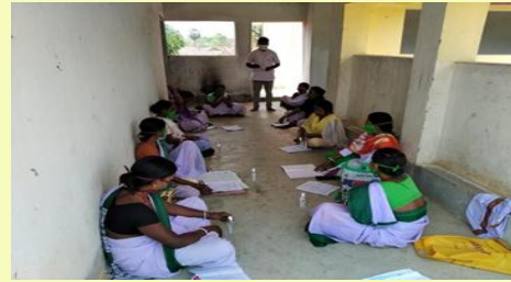
INCREASING THE CAPACITY OF GOVERNMENT WORKER

Badlao has already developed a survey format and taking the activity ahead to identify the existing number of people suffering from any kind symptoms which is related to covid 19. Umang team will be responsible for conducting survey. From Jamtara we have already collected some data. By gathering the information field facilitators find out the list of the community people who are not getting the support from Govt. or any other local organisation.