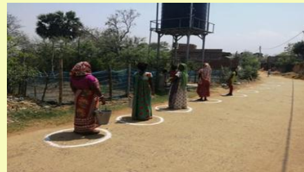
Social distancing – Kewarjali and Chandradeepa Village

We have also spread awareness among with the community people with the help of our facilitator about social distancing by marking with the spots to maintain the average distance.