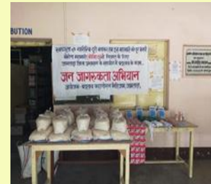
Food Packets distribution at Korapara, Mihijham by Badlao Foundation