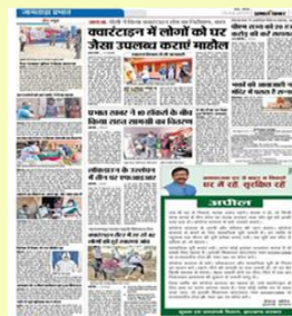
Newspaper Coverage- Prabhat Khabar & Dainik jagran