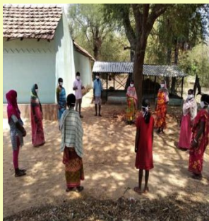
Social distancing – Kewarjali and Chandradeepa Village