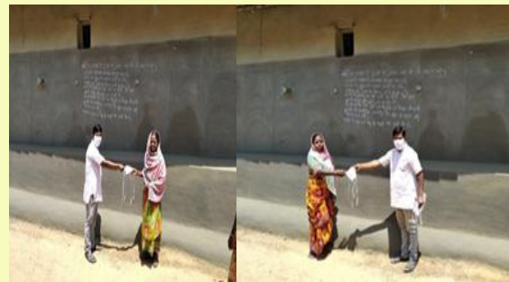
Mask distribution –village kherwa