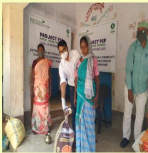
Our staff distributed foods with the support of govt.officials