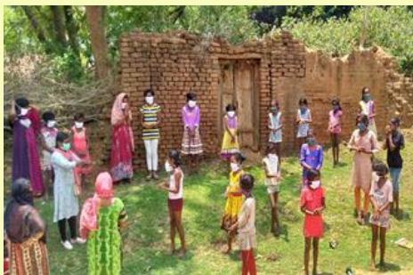
Social Distancing Awareness Campaign