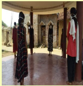
Badlao Healing the pain to make them feel together we can...